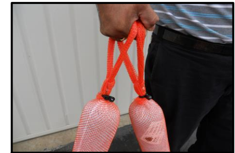
Easy Lift Handles with Cable Ties

Stock Sizes Model Number 4' foot = Model: WWW-04-48 6' foot = Model: WWW-04-72 10' foot = Model: WWW-04-120 (Custom sizes also available)