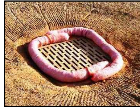
Erosion control for catch basin protection