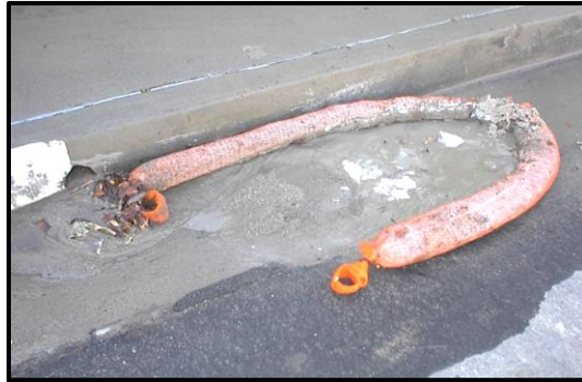
Shown here capturing stucco and plaster from a jobsite

The Weighted Walnut Wattle was designed with the intent of reducing pollution being delivered by urban water runoff to beaches, streams, wetlands and other bodies of water. The filter provides homeowners, commercial property owners, municipal employees and construction personnel with a method of significantly reducing urban water runoff pollution. The Weighted Walnut Wattles™ can be used as part of your "Storm Water Pollution Prevention Plan" and also conforms to urban water runoff "Best Management Practices."