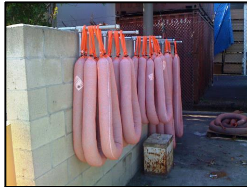
Easy storage for Weighted Wattles