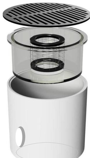
Round Catch Basin Shown

TRITON – TR SERIES FILTER By REM Inc. Ph# (888.526.4736) Sales@remfilters.com Remfilters.com