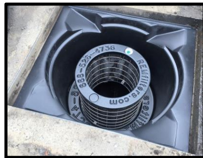
Model: TR24SR-D (shown above)