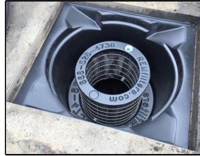
Model: TR24SR-D (shown above)