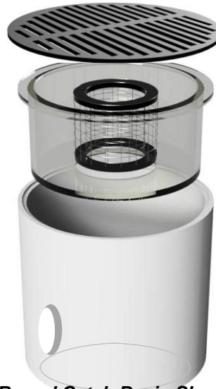
Round Catch Basin Shown

TRITON – TR SERIES FILTER By REM Inc. Ph# (888.526.4736) Sales@remfilters.com Remfilters.com