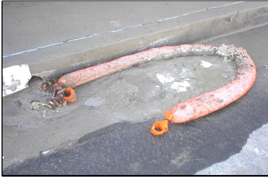
Shown here capturing stucco and plaster from a jobsite

The Weighted Walnut Wattle was designed with the intent of reducing pollution being delivered by urban water runoff to beaches, streams, wetlands and other bodies of water. The filter provides homeowners, commercial property owners, municipal employees and construction personnel with a method of significantly reducing urban water runoff pollution. The Weighted Walnut Wattles™ can be used as part of your “Storm Water Pollution Prevention Plan” and also conforms to urban water runoff “Best Management Practices.”