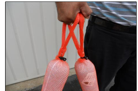
Easy Lift Handles with Cable Ties