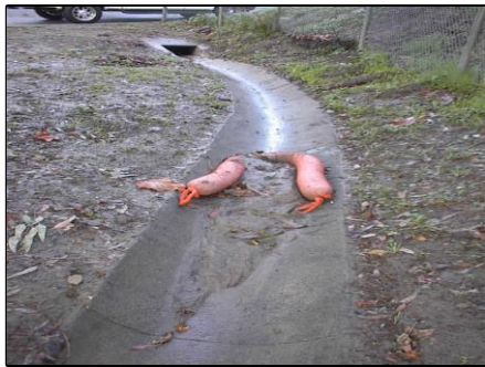
Erosion control for Trench or V-ditches