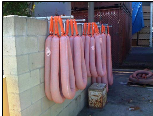
Easy storage for Weighted Wattles