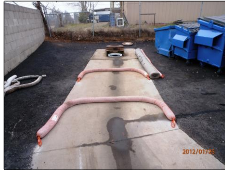
Multiple filtered stages First Wattle: Heavy/large pollutants Second Wattle: Finer filter polishing