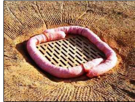
Erosion control for catch basin protection